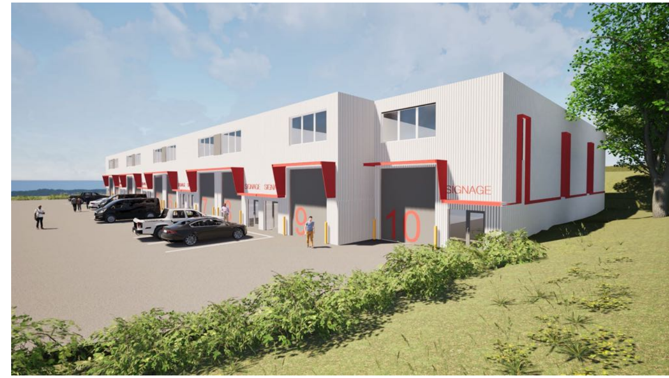
2 PARKING VIEW BLDG C Scale: Actual Size